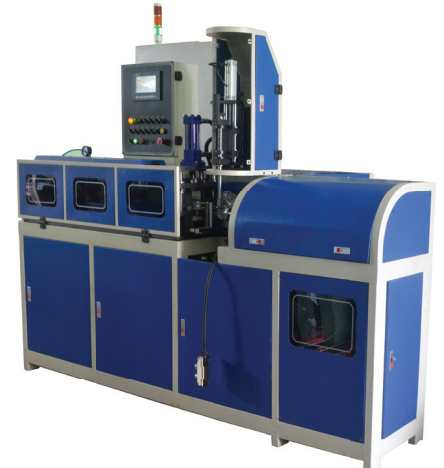
Full automation version